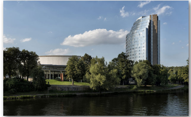
Maritim Hotel and Conference Center Ulm

The conference offers an ideal platform for LS-DYNA and LS-OPT users to present, share and discuss their work as well as to obtain information about the latest trends and products of the complete CAE process chain. Moreover, there will be special sessions on HPC hardware as well as cloud platforms offering a simulation environment for LS-DYNA.