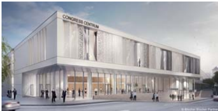
New Congress Centrum Würzburg