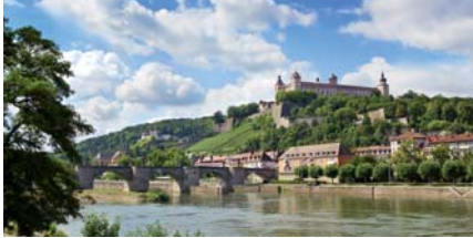
Marienberg Fortress Würzburg