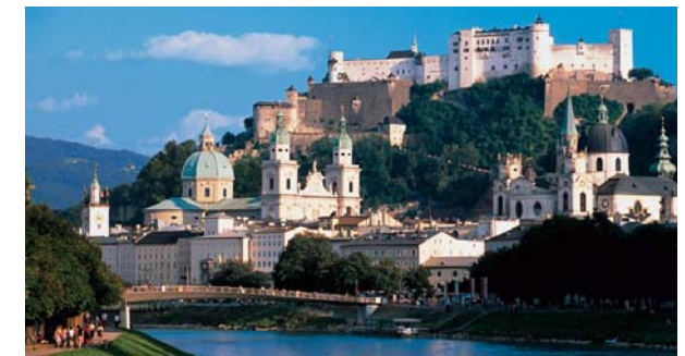
City of Salzburg